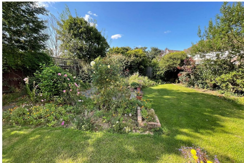
SALE AGREED BY NEWBOULDS & CO